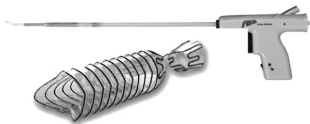
FIG. 1. Allium™ triangular prostatic stent (TPS) and Tiemman-like delivery system.

irritative symptoms. It is built of a body of eight different lengths ranging from 30 to 65 mm with a large caliber (45F); attached to the body with a trans-sphincteric wire is an anchor (Fig. 1), which reduces the chance of stent migration. Once inserted into the urethra with the aid of its special inserter, the stent is released to allow its self-expansion.