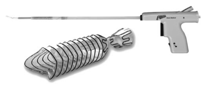
FIG. 1. Allium<sup>TM</sup> triangular prostatic stent (TPS) and Tiemman-like delivery system.

irritative symptoms. It is built of a body of eight different lengths ranging from 30 to 65 mm with a large caliber (45F); attached to the body with a trans-sphincteric wire is an anchor (Fig. 1), which reduces the chance of stent migration. Once inserted into the urethra with the aid of its special inserter, the stent is released to allow its self-expansion.